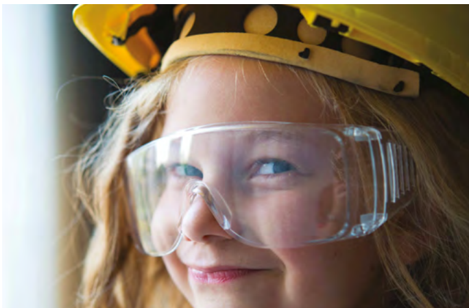
TO DREAM BIG