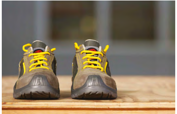
FOR EVERY DAY