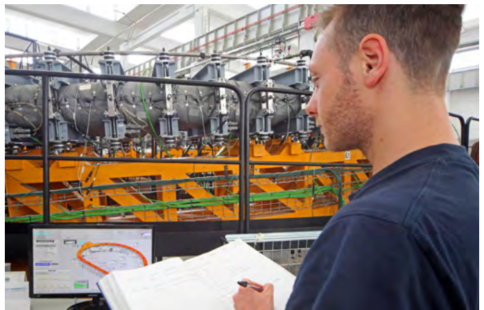
FOLLOW THE PROCEDURES