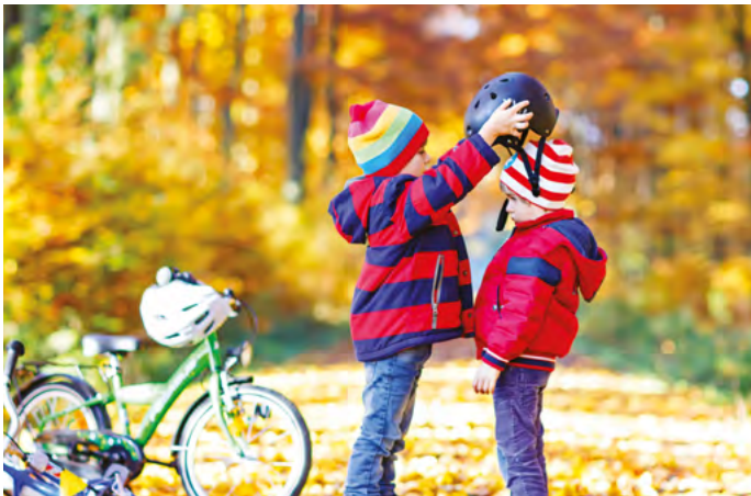
TO REACH A GOAL