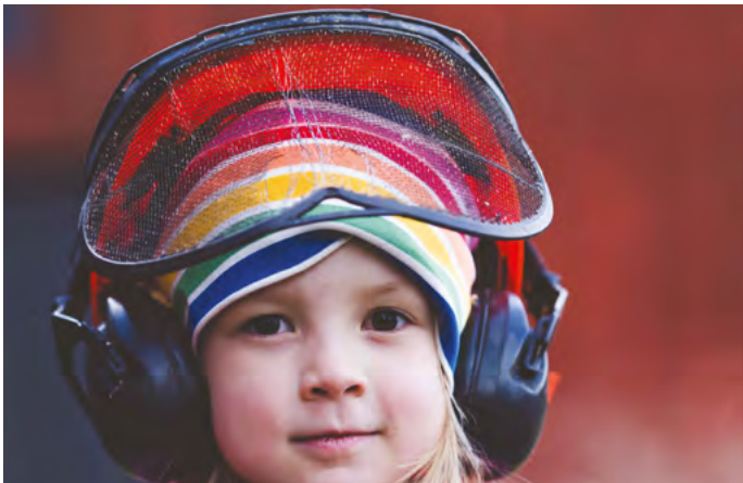
FOR YOUR FUTURE