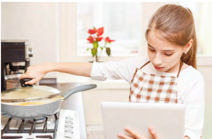
FOLLOW THE RECIPE