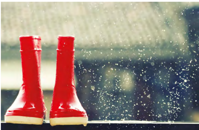
FOR RAINY DAYS