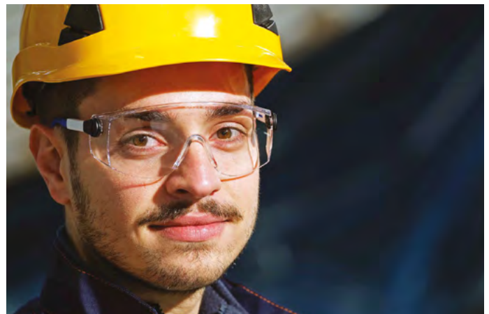
TO WORK BETTER