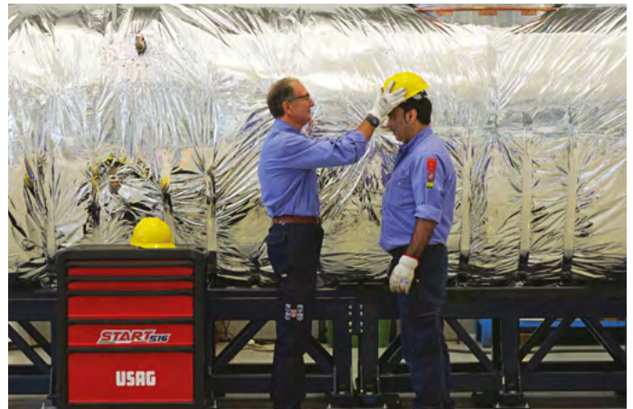
TO RESPECT LIFE